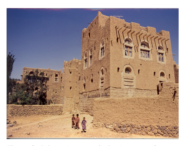
Figure 2: Private house built in the town of Amran in Yemen in 1985

For durability, earth should only be used where it is not prone to water or damp and, for maximum advantage, appropriate designs and construction techniques need to be selected. Optimum designs will depend a lot on the environment (natural drainage, water table...), the climate (rainfall quantity and intensity, and strength and direction of winds during rains...), and on the maintenance practices of the users, as well as on the sensitivity of the soil to water.