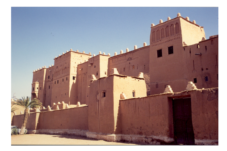
Figure 4: The Kasbah of the Glaoui at Ouarzazate in Morocco. Built by the beginning of the 20th century.

Plasters or renders are important in protecting walls from damage by rain, wind and abrasion, as well as for decorative effect, and earth-based materials are quite often used. Mud mortars are an ideal jointing material for use in earthen based walls and other structures as well as in