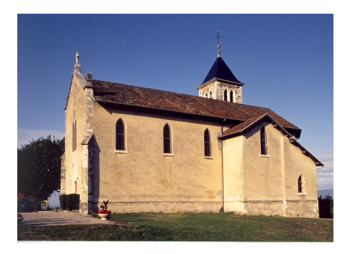
Figure 3: Church biult in pisé (rammed earth) at Charancieu in the Dauphiné region of France.

Laboratory-based tests have also been developed and these are more accurate indicators.