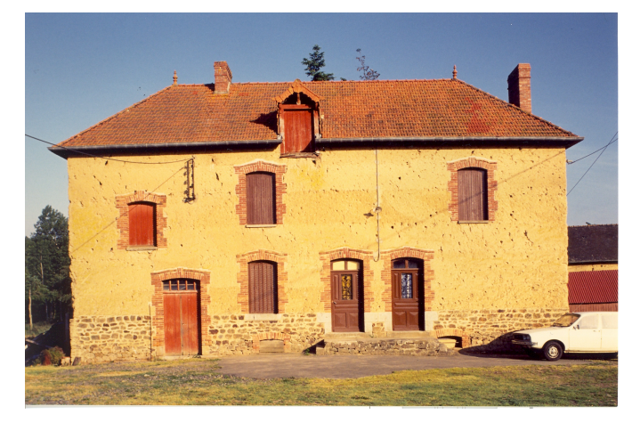
Figure 1: House near Rennes in France built at the end of the 19th Century

Clays have a variety of uses, especially for ceramics, but it is their use as binding materials in the unfired state which is described in this leaflet. Although they have the limitation that they soften when wetted, they are also undoubtedly the